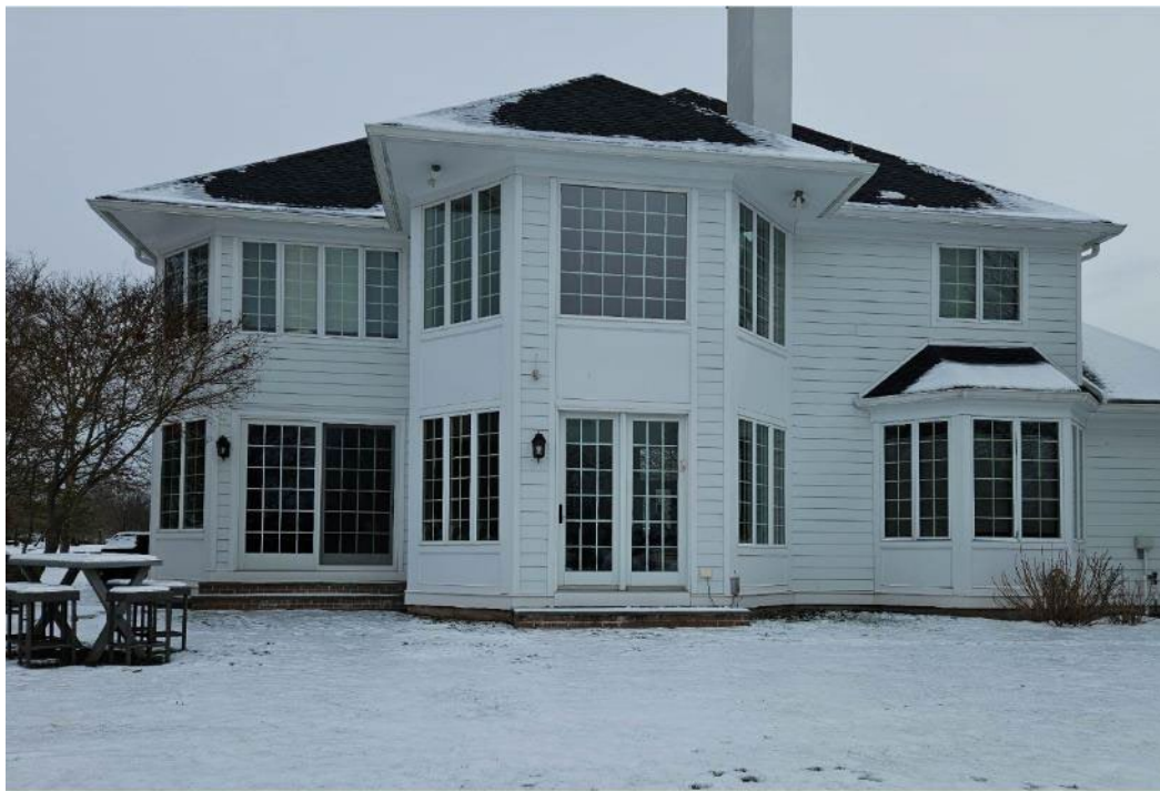
Rear of Existing Dwelling at 17 Augusta Court

An image of the rear of the building as it exists is provided below. The following page contains images of the proposed rear yard in plan view, and the elevation provided by the applicant.