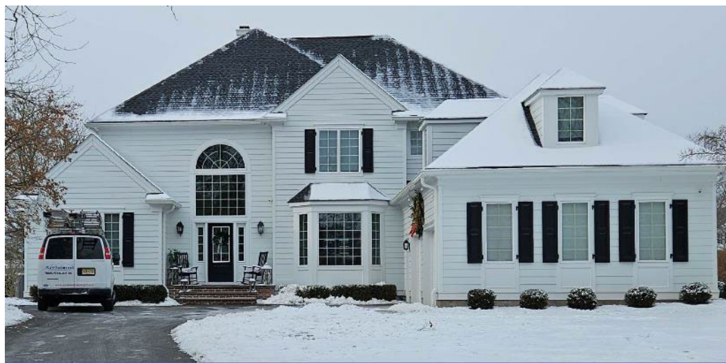
Existing Dwelling at 17 Augusta Court